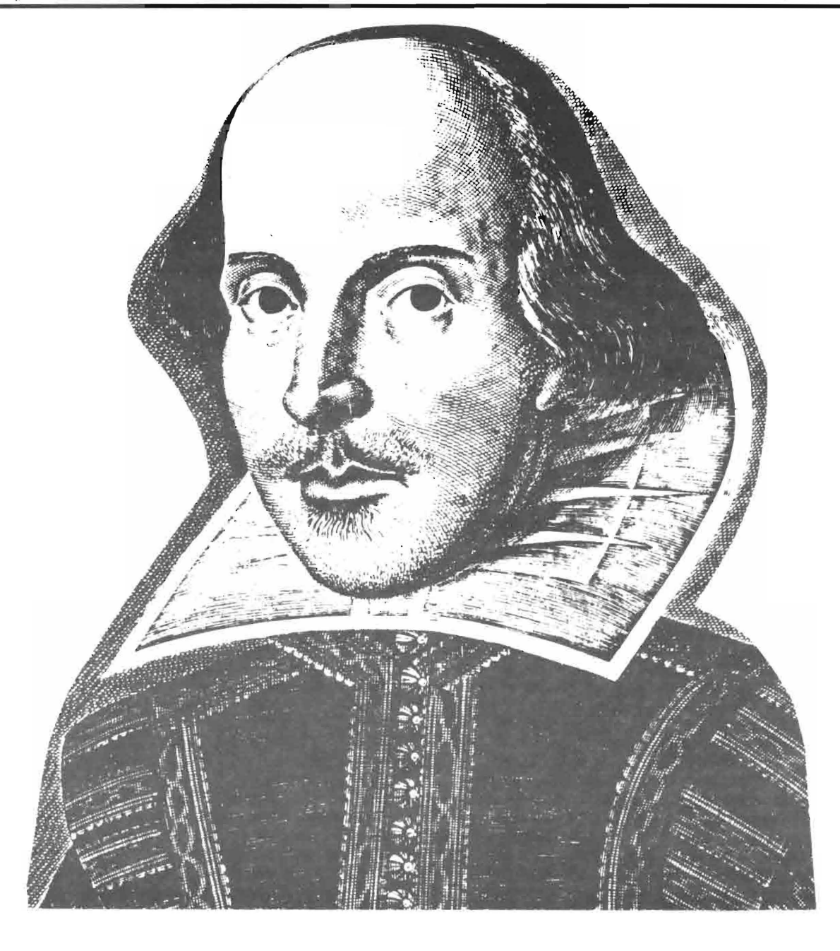
WILL SHAKESPEARE'S DIM VIEW OF BLACKS