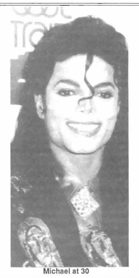
INSTAURATION—JULY 1991—PAGE 9