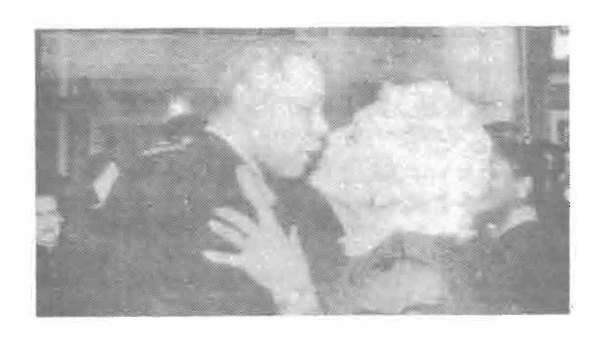
Colin Powell and Barbara Bush dancing lip to lip. The photo by Manny Rocca of the Washington Times was awarded a prize by the White House Photographers' Association.

energy and money for black causes, and what is Bush's payoff? A massive display of black cold shoulders, even after he had massaged Hampton students with flattering statements about their wondrous qualities and with gratuitous, uncalled-for attacks on prejudice (white prejudice, that is, not the black variety).